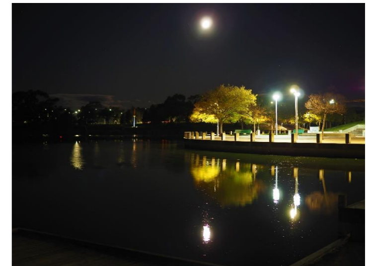
"Tuggeranong has its own lake?" i_have_an_account, Reddit, 2018