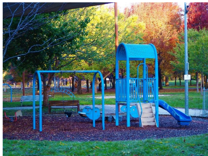
"There is a reason the south side population is shrinking and why the north has exploded and that reason is, Nappy valley has all grown up and their babies have run off to get drugs and do stabbing of their own." Loves-pineapple-P, Reddit, 2022