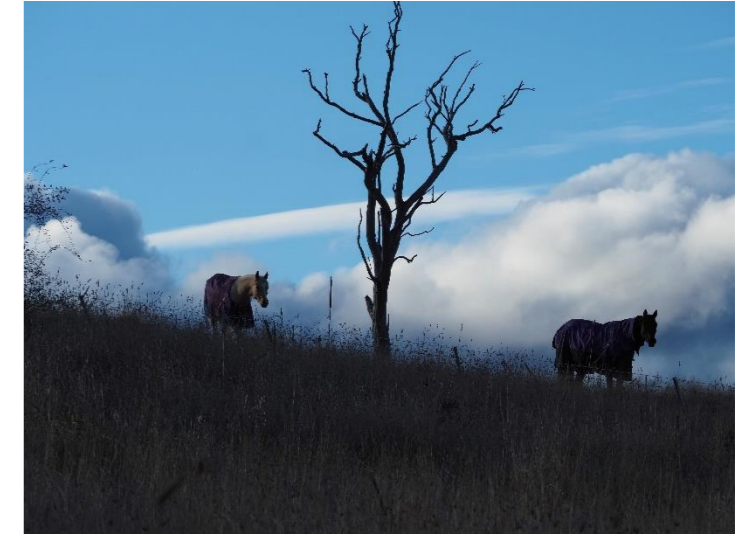
"Dammit I hate Tuggeranong. Let's redraw the boundaries of the ACT/NSW and get rid of it." Mystery Man, The Riot Act, 2012