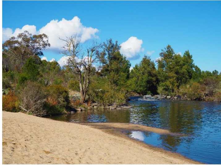
"I love most of the rivers around Canberra, but Pine Island is utter scunge. Broken glass and rubbish littered all over the picnic area, the bank, and in the river. If you want to step on a needle, this is the place for you. If you actually want to enjoy yourself go to Angle Crossing or the Cotter." Timmci92, Tripadvisor, 2017