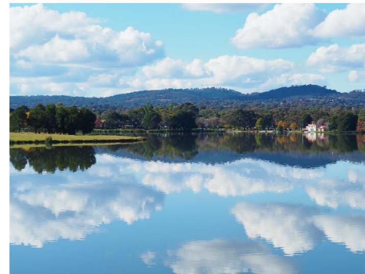
"The number of empty ACTION buses coming into Tuggers needs to be doubled so more fresh air can be imported and released." Dungfungus, RiotAct, 2016