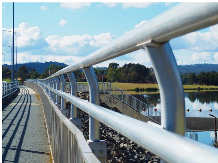
"The Southside hoods, hope you weren't mugged for your phone while taking the photo". TK79, Reddit, 2018