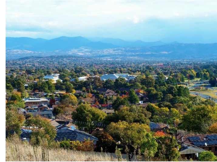
"Fill the Valley with cement, grind it flat and start over." Shenko-wolf, Reddit, 2023