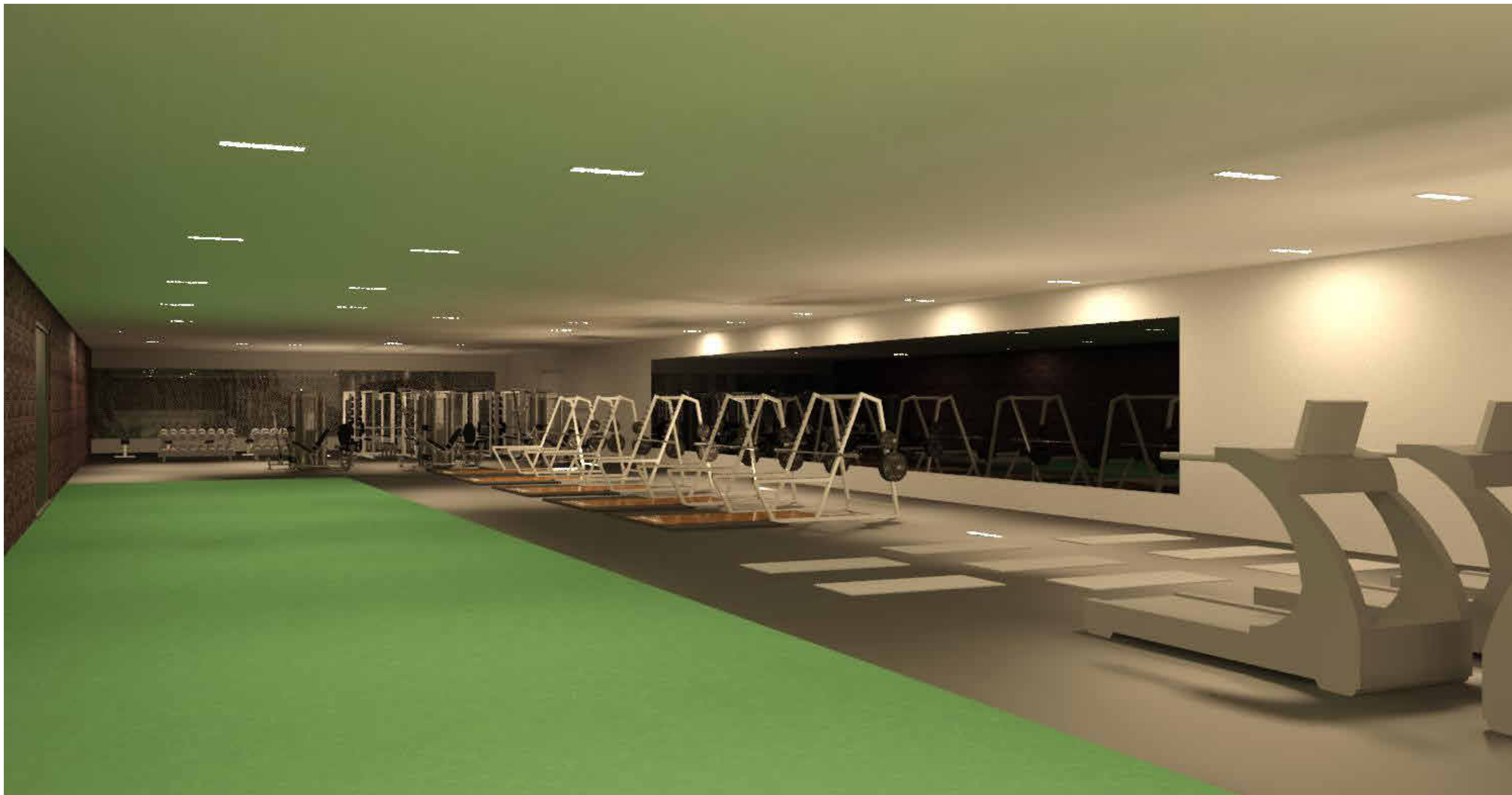
2 GYM 1:1