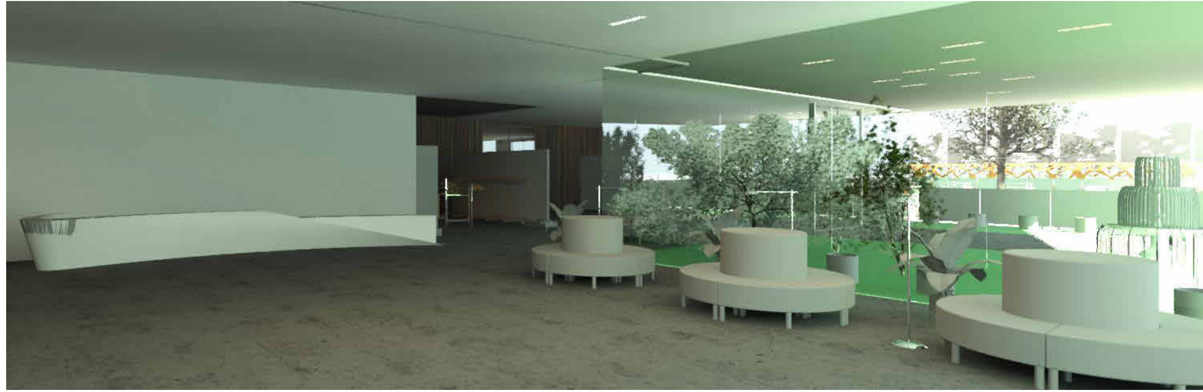
1 Reception 1:1