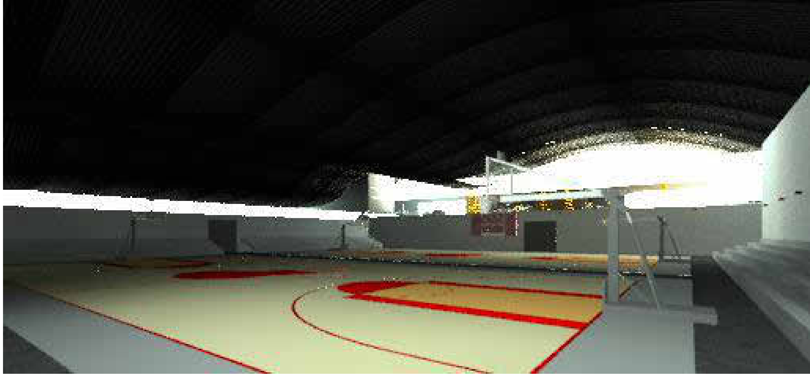
1 STADIUM 1:1