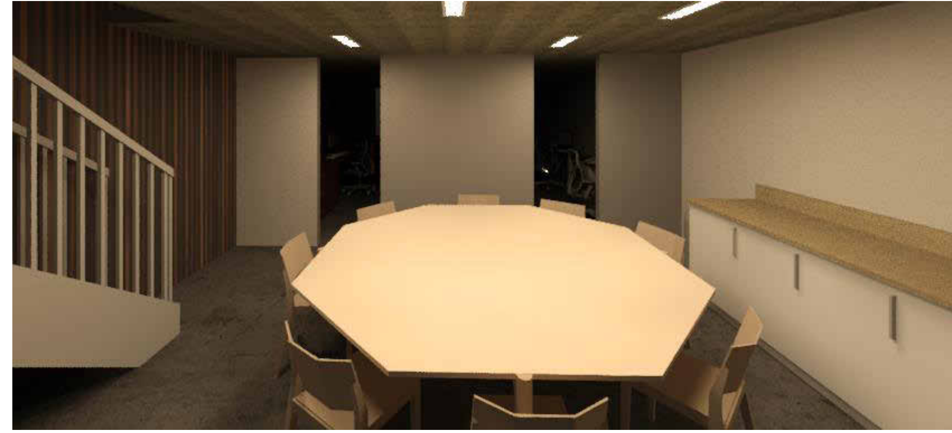
2 Staff room 1:1