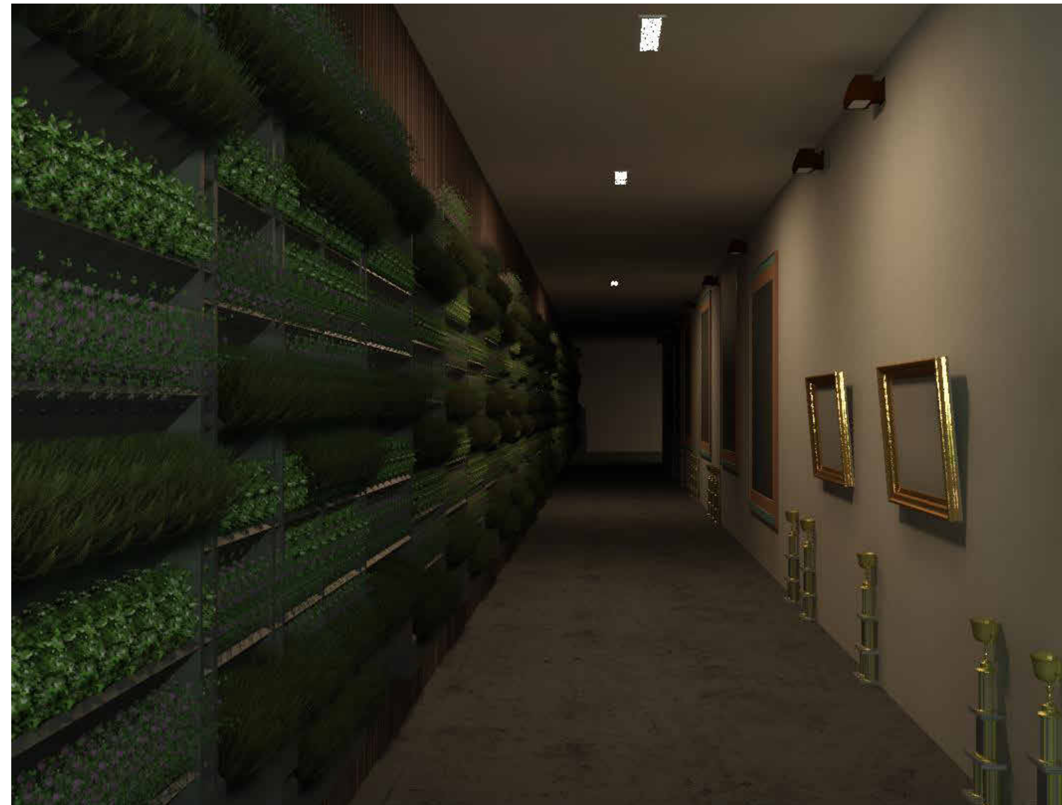
4 HALLWAY 1:1