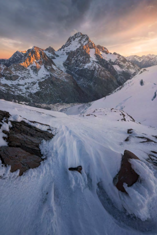
Landscape images by William Patino in the style I admire