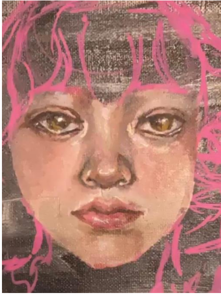
Initial painting session