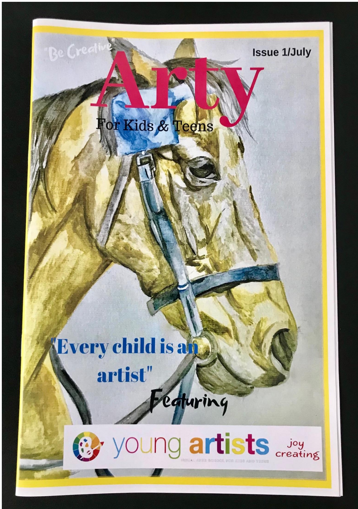
Cover of Magazine