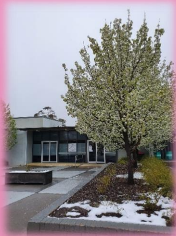
Pre-development 1892-2020 3

The Aquatic Centre was established in 1892 with the Master Plan of 2007 outlining upgrades which were finalised in 2016. The Aquatic Centre features an Olympic-size outdoor pool (opened 1966), a toddler pool, an indoor heated pool and on-site gym. In August 2020, major upgrades began for the redevelopment of the Aquatic Centre.