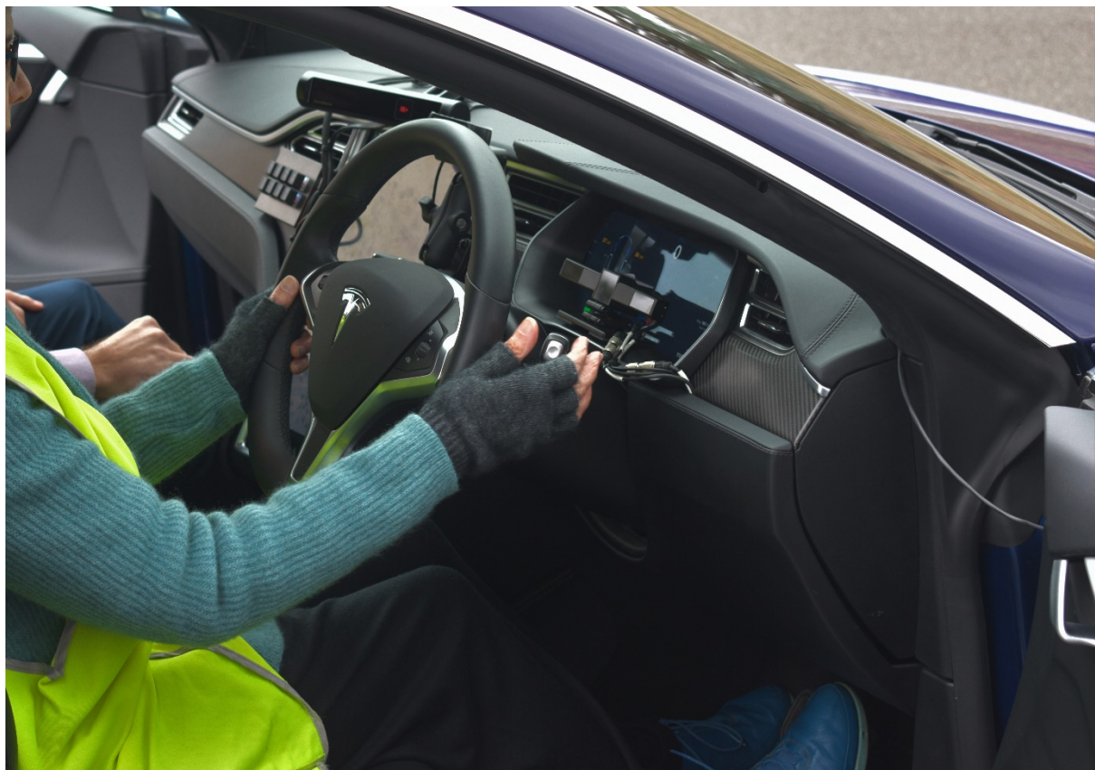
Figure 5: A participant prepares for the test-drive.

Following demonstration and the test lap, all participants agreed to operate the Tesla S and all participants (n=23) activated the autopilot function during the test-drive.