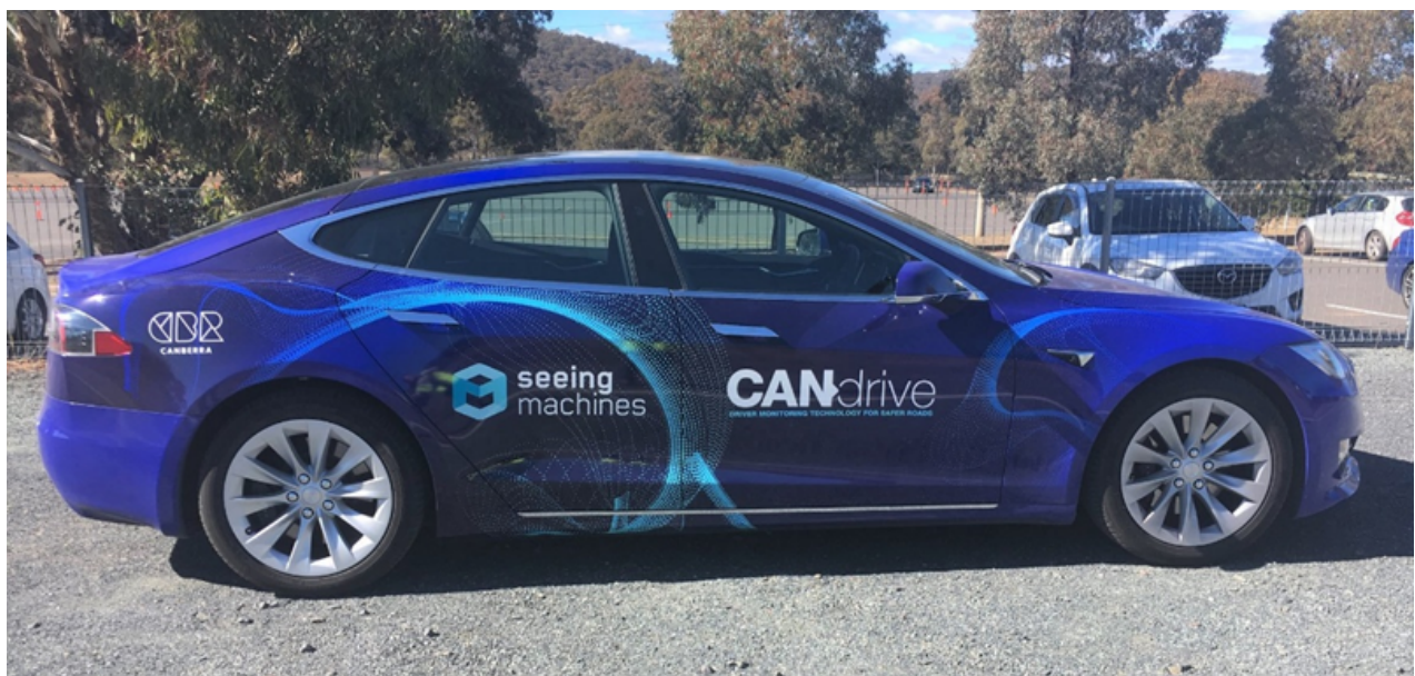
Figure 2: Tesla Model S75 used in this study.