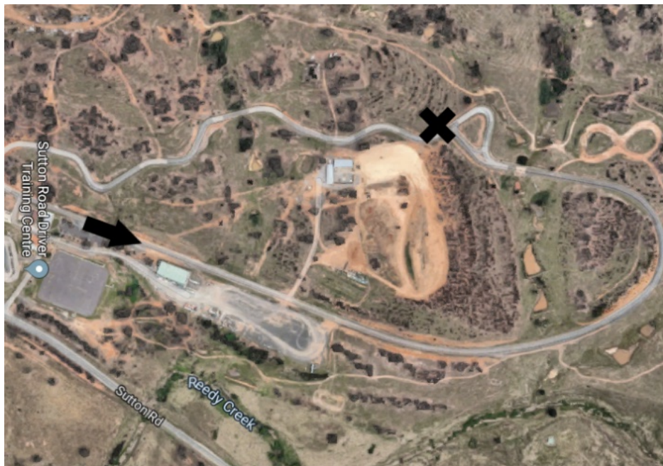
Figure 3: Aerial satellite image of track displaying start and end of test-drive route (Map Data 2019: Google, CNES/Airbus, Maxar Technologies).

The test-drive took place on a track completely closed to other traffic for the duration of the study procedures. The track was paved and included conventional lane markings. The route was predetermined and included a section of straight road, a bend and a dip (Figure 3). Testing took place during daylight hours under fine weather conditions.