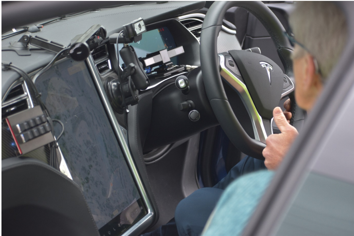
Figure 4: Researcher demonstrating the vehicle features.

was travelling at approximately 30 kilometers per hour or above. Participants completed two laps of the designated route. The test drive took approximately 15 minutes.