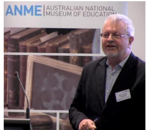
Author Craig Campbell