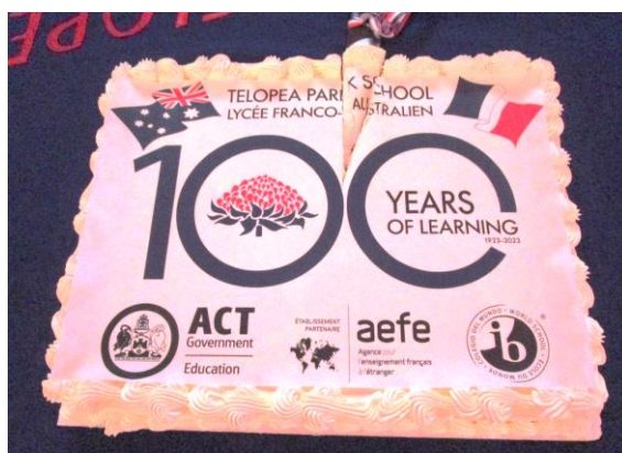
Anniversary Cake