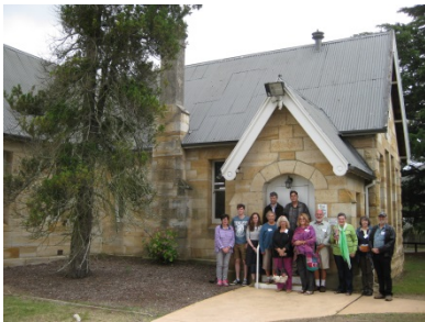
Mittagong's Original School Building