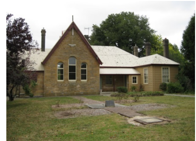
Sutton Forest Public School