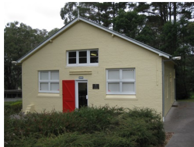
Frensham School Archives