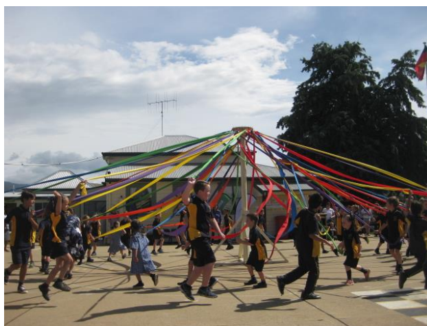
Students Celebrate with the Maypole Dance