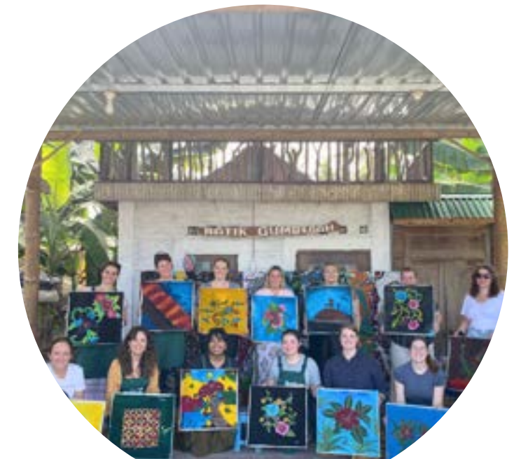
Cultural and Recreational activities