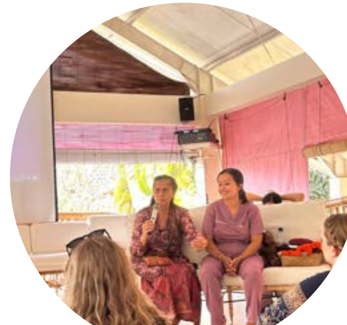
Lectures from experts in their fields