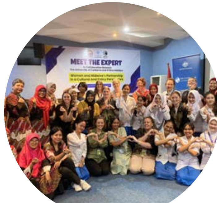
Collaborate with Indonesian peers