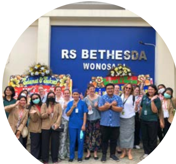
Visit healthcare centers