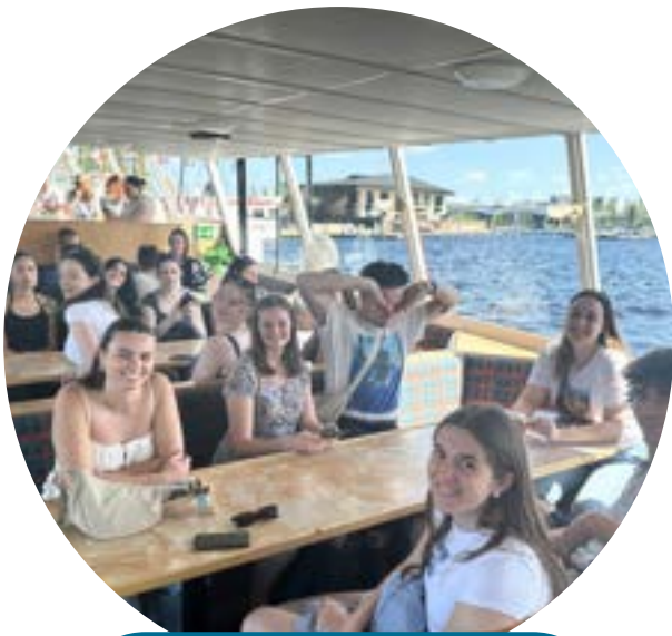
Recreational and cultural activities