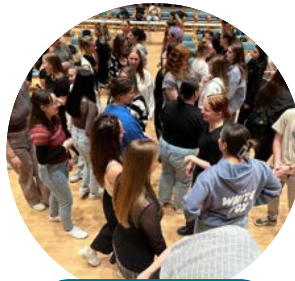
Collaboration with Finnish peers