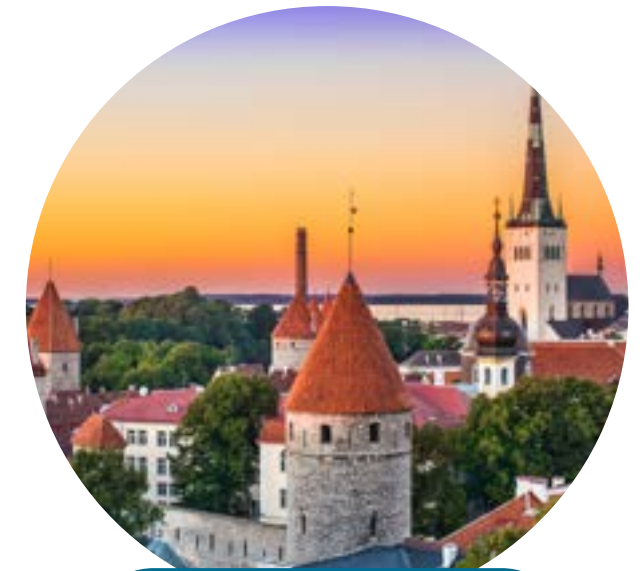
Trip to Tallinn, Estonia