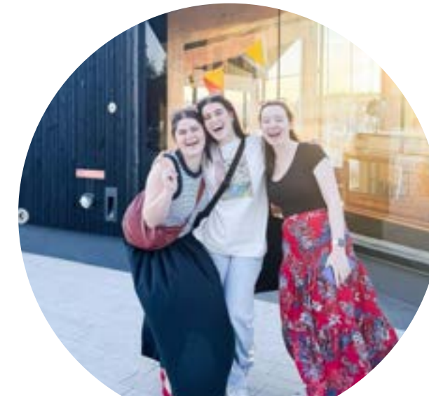
Free time to explore