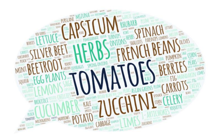
Fig 2. Frequency of varieties reported in weekly produce uploads