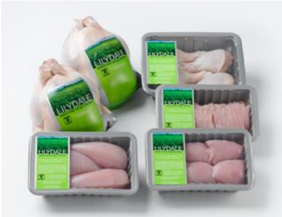
Figure 2 Image of Lilydale packaging

The Lilydale Free Range Chicken label also carries a logo stating that their farms are maintained to the standards set, and are accredited, by Free Range Egg and Poultry Australia. (For further information, see http://www.frepa.com.au/main.html .)