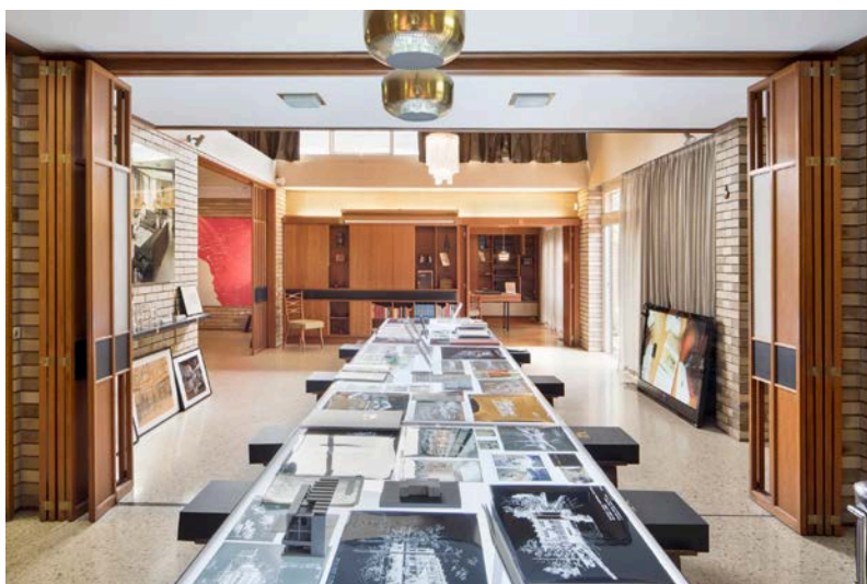
Figure 4. View from the dining room looking across the living room with the study beyond, Fooks House, North Caulfield, Victoria (1964-6) during the exhibition, 'Ernest Fooks: The House Talks Back', December 2016.

now showing signs of deterioration in built in cabinets, finishes and appliances. The house was carefully detailed and exquisitely crafted: 83 drawings were produced for the project.