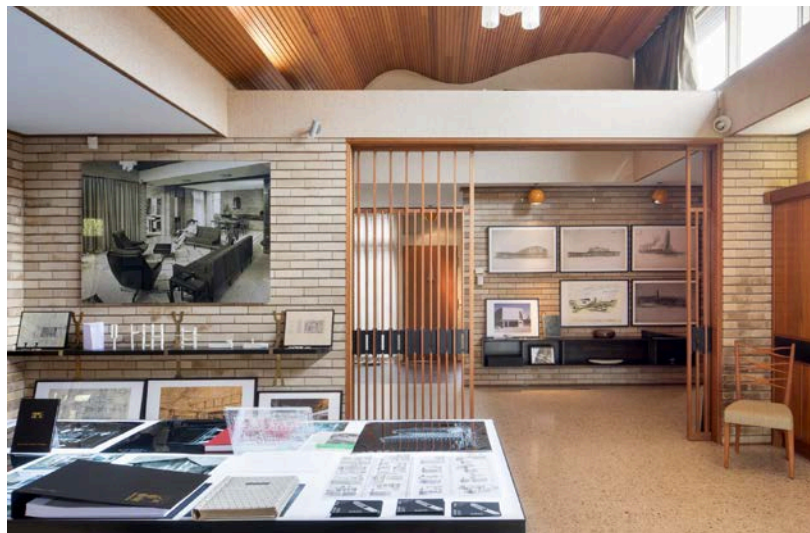
Figure 3. Living room, Fooks House, North Caulfield, Victoria (1964-6) during the exhibition, ‘Ernest Fooks: The House Talks Back’, December 2016.

32 Howitt Road was designed to be unassuming from the street - the drama unfolds in the interior layout and detailing - but it also stands out as unusually welcoming and open in the context of a street that has changed over recent years with the erection of defensive boundary walls and security entrance gates. The flow from the front (west) to the rear (east) is through a series of spaces, which vary in their degree of enclosure. One enters from the street via a front garden with a winding path of slate slabs with dark grey pebbles inset between, a curved broken brick wall, and then into a covered courtyard space which Fooks referred to as an “outdoor” gallery. 11 This courtyard, with rockery and pond on one side and shelves for planting on the other, leads via a “primitive” main front door into a tiled entrance lobby and then onto the ‘indoor picture gallery’ or anteroom, which allows for a space to pause. This anteroom experience is reinforced by Japanese-influenced timber mesh screens, which are hidden in the brick walls flanking the entrance to the main living space.