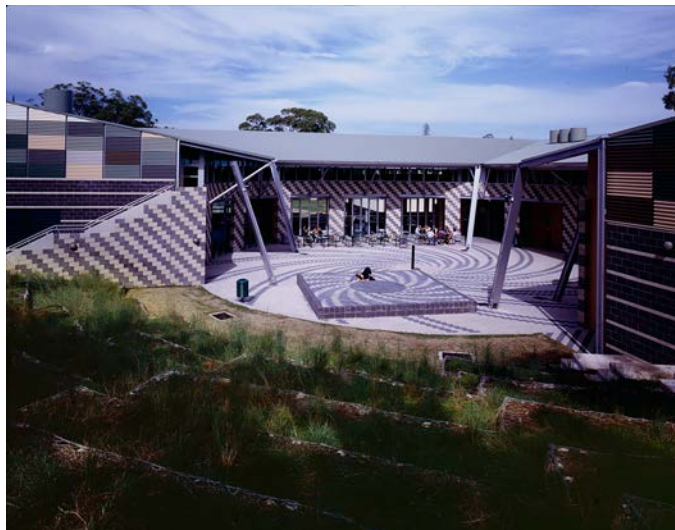
Figure 4. View from the open-air amphitheatre (in the north-east) of the central courtyard of Don Watson's student centre at the Morningside College of TAFE.

College of TAFE (1996-1997). Here, it was laid in the pattern of a giant swirl, originating at the heart of the building's central courtyard, and tapering out onto its walls. Like Ithaca, the plan of the building resembles a square doughnut, albeit one with a bite taken out of its sunny, north-east corner, where an open-air amphitheatre makes the most of the hill against which the building is set. To enhance its assimilation – or, its “contextuality” – in the natural campus environment, Watson topped the building's base of striped and chequered grey and cream-coloured brickwork with an undulating and folded cloak of sheet metal and translucent acrylic panels in a camouflage design. 23