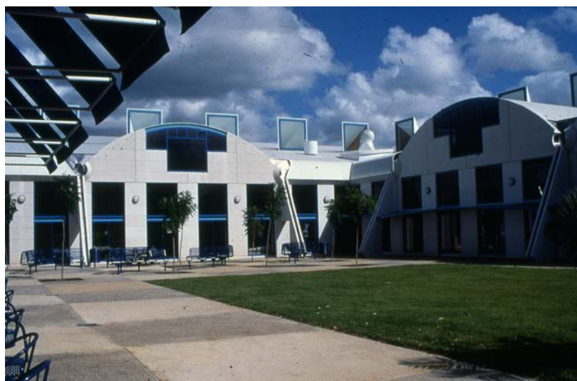
Figure 5. View of Watson’s Meadowbrook building from the courtyard: an array of square skylights line the crest of the roof, and demi-portico, demi-buttress downpipes, are positioned at regular intervals along the Eastern and Southern walls.

Similar formal quirks and quips also recur in Watson’s other TAFE designs. At Meadowbrook, the upper floor of the northern corridor features a mannered series of two-dimensional geometric shapes – a line, a circle, a triangle, a square, and a hexagon. Some of these are functional – framing a window in a door or wall – others purely formal. Each of these shapes is illuminated by a triangular opening in the ceiling, connected to a large skylight, which (on the outside) manifest themselves as an array of square periscopes, overlooking the courtyard from the ocean-blue (interior) corridor.