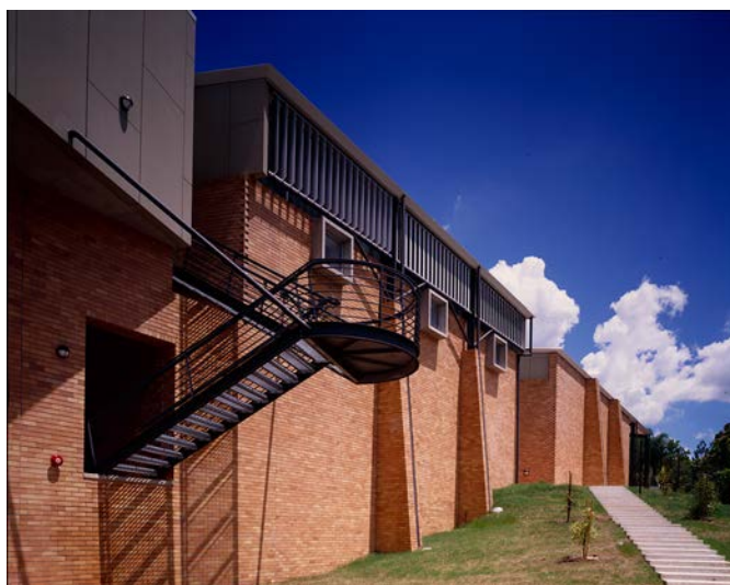
Figure 6. Western wall of the Computing Amenities Building at the Ithaca College of TAFE.

geometries and a strong sense of place, making a new, contextually apposite whole out of many fragments, as unlikely (or 'difficult') as it may seem.