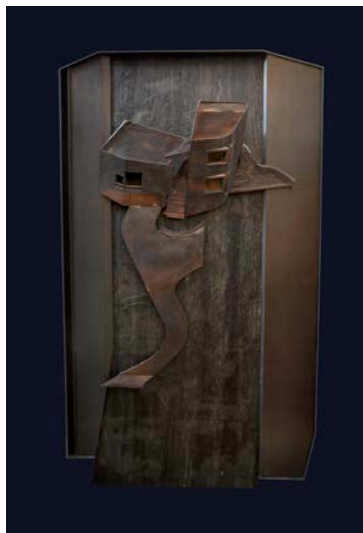
Figure 1. Ashley Drawl, by Coy Howard, 1980. Image printed with permission from Coy Howard.

One body of work included in the California Counterpoint exhibition that demonstrated the confluence of representation and objecthood was Coy Howard’s Drawls that physicalised some of the properties explored in his graphite perspectives [Figure 1].