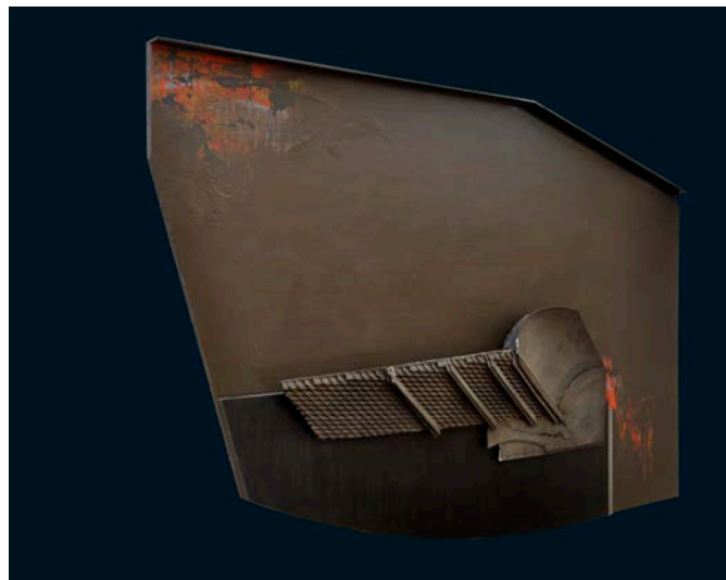
Figure 3. Daniel Studio Ceiling Drawl, by Coy Howard, 1980.

A complimentary Drawl for the Daniel Studio is a ceiling study that investigates how a coffered form with staggered beams meets a barrel vault [Figure 3]. The articulated effects enrich the understanding of an architectural detail through low bas-relief and its compositional aesthetic. Instead of a typical detail drawing that conveys abstract technical information, Howard's sectional Drawl physicalises a representation of the ceiling's experience. Oblique architectural forms painted in dark hues set onto a backing with matching and contrasting geometries completes a form that avoids singular readings, triggering associations to El Lissitzky's Prouns and primitive objects from an archaeological dig. The Drawls dismantle preconceptions about representational aspects in architecture by merging recognisable and unfamiliar objects. Identifiable objects juxtapose, and sometimes conflate, with objects that remain undefined. The work instigates a process of looking at something to see the connections between forms, generating an overall sense of the piece in a feedback loop between the various elements of the configuration. Through the Drawls, Howard sought properties to create a "quality of geometric order to constantly be shifting and changing". 15