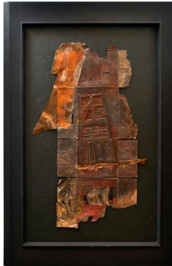
Figure 4. Palmer Eckard Condominium Drawl, by Coy Howard, 1979. Image printed with permission from Coy Howard.

offering alternative criteria to measure architecture's performance. What Howard renders, though subdued, participates with distinct codes and languages of architectural practice, even if it only occurs when recognising that in parts of a Drawl a person fits inside. This residue of performance creates fitness relative to his ideas about form and occupation. Recognising a form as a ceiling, in the case of the Daniel Ceiling Drawl, does not limit creative response to that form, but guides creativity to perceive and imagine the concept of a ceiling with renewed vitality.