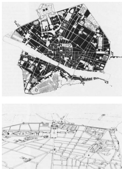
Figure 3. Completion and extension of an existing city as 18 th c park. Firenze Interrotta, Studio Projects (1980): Proposed plan, Axonometric: New Quarter Del Prato ( The Cornell Journal of Architecture , 2 (1983), 133).

The third kind of quotation at work in Collage City and in student work is that in which the park is referenced as the paradigm for formal decisions as well as evocation of urban character. Collage City is explicit about the potential of the garden model. It appears early in the text and occupies a prominent place in the Excursus: this is quotation as forming architectural character by means of the park as model and as city image. To take only the most evident, the gardens of Chantilly, Verneuil, and the Park Monceau are constants in Collage City and underlay the thinking at work.