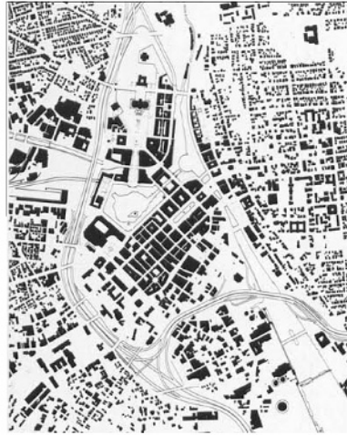
Figure 2. Fabric and open space as figure and ground. D.B. Middleton, Providence: Capital District Development Strategy, Proposed site plan (1980) ( The Cornell Journal of Architecture , 2 (1983), 128).

conditions. This form of implied and explicit quotation of form-generation strategies runs throughout the text and finds its purest rendition in the composite building. The Quirinale and Manica Lunga, Rome, the Palais Royal and Louvre of the Plan Turgot for Paris, and the Hofburg, Vienna, are examples of this: buildings which both shape space and are shaped by it. Composite buildings are two-faced.