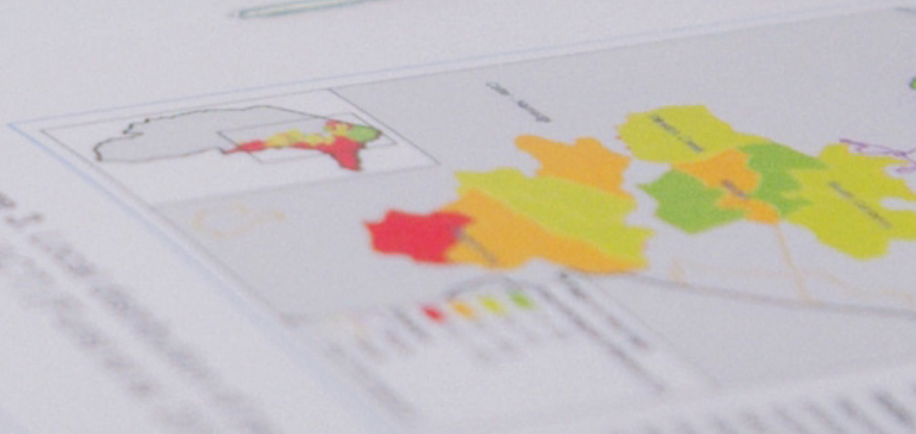
Figure 1. Map of the region showing the distribution of the variable of interest.